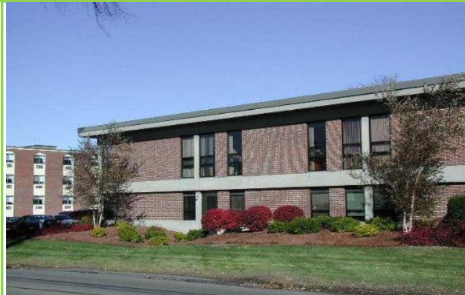
SIDE FACING FRANKLIN ST.